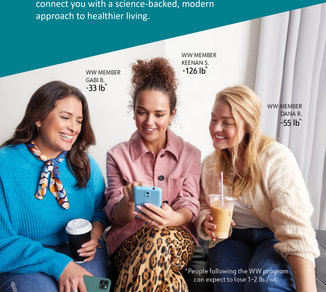
WW MEMBER GABI B. -33 lb ^

We've partnered with WeightWatchers to connect you with a science-backed, modern approach to healthier living.